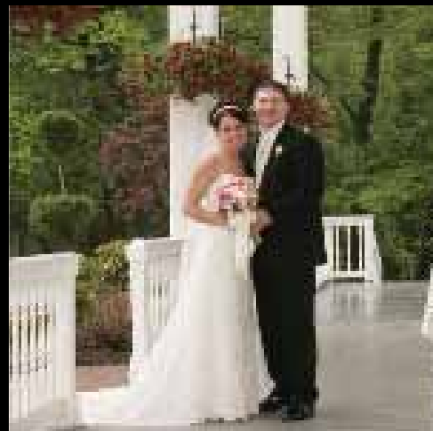
Beautiful Grounds for Photos